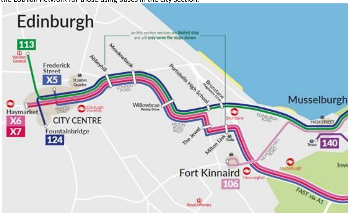
Map showing EastCoastbuses services in Edinburgh

A complete review of the network has been undertaken. New limited stop patterns will be introduced within the city, as shown on the map below, reducing journey times from East Lothian. Alternative services continue to exist on the Lothian network for those using buses in the city section.